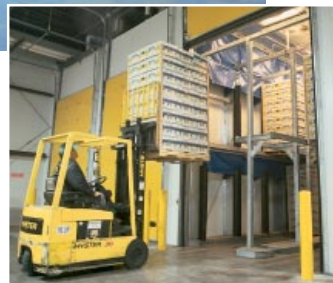
Two-tier, 44 pallet TarPless® ripening Rooms with Side-Wall™ cooling coils. Safeway - Portland, Oregon.

The TarPless® ripening room gives you a choice of Side-Wall™ or Uni-Ripe® cooling coils for single-wide or double-wide room configurations with dual-temperature capability.