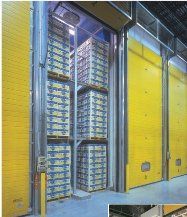
Three-tier, 42 pallet TarPless® ripening rooms with Uni-Ripe cooling coils. Wal-Mart - Winterhaven, Florida.

For the Most Apeeling Fruit at the Guaranteed Lowest Operating Costs