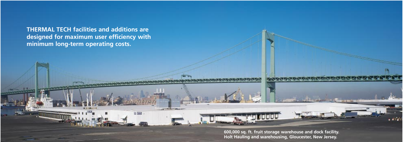
600,000 sq. ft. fruit storage warehouse and dock facility. Holt Hauling and warehousing, Gloucester, New Jersey.

THERMAL TECH facilities and additions are designed for maximum user efficiency with minimum long-term operating costs.