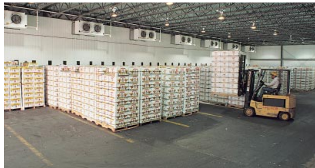
21,000 sq. ft. Banana Conditioning Warehouse. Banacol, Eddystone, Pennsylvania.

Your project gets completed faster, saving you time and money while realizing the earliest, most efficient return possible on your investment. That's the THERMAL TECH difference.