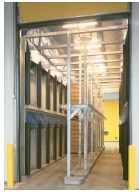
Two-tier, dual entrance, 44 pallet TarpLess® Ripening Rooms. Safeway Distribution Center, Portland, Oregon.

Call 1-888-4-MRPEEL for your free TARPLESS® ripening room video, or visit our web site at www.thermaltechnologies.com