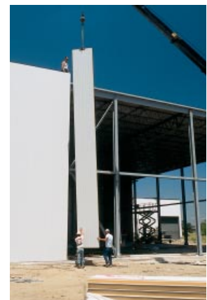
34,200 sq. ft. Freezer Addition. Tartan/Sysco Foods, Philadelphia, Pennsylvania.